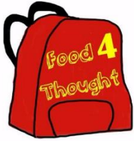
A backpack buddy program

Food 4 Thought is wrapping up its 3rd full year distributing backpacks to food insecure grade school and middle school students living right here in Wilsonville. We know that about 1/3 of all students in the schools we serve (Boeckman Creek Elementary and Meridian Creek Middle) are free and reduced lunch cost eligible and at times struggle with hunger. We are