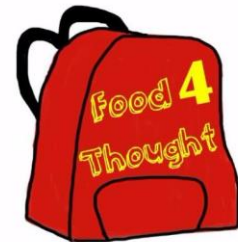
A backpack buddy program